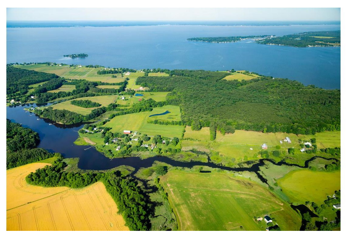
The Wicomico River, top, and Whites Neck Creek, bottom, flow toward the Potomac River in Charles County, Md., on June 5, 2018.