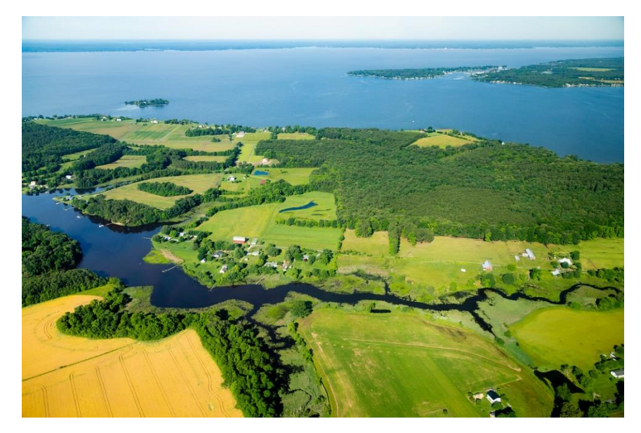
The Wicomico River, top, and Whites Neck Creek, bottom, flow toward the Potomac River in Charles County, Md., on June 5, 2018.

Management Strategy 2020–2025, Updated Nov 2022