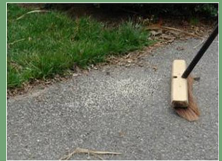
Sweep fertilizer off of pavement