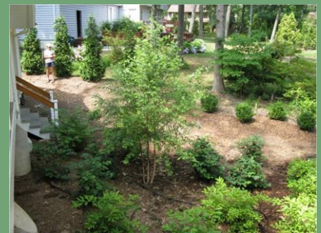
Conservation Landscaping instead of turf