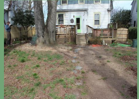
Maintain dense turf cover; avoid bare soils