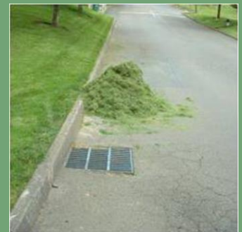
Keep clippings out of storm drain