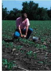
Figure A-2-2. A crop consultant collects a soil sample to test nitrogen availability in the soil. A test like this helps decide how much nitrogen the growing crop needs for optimum production.

BMP Reference Sheet A-2: Nutrient Management