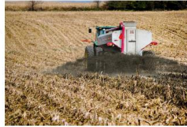
Figure A-2-1. A tractor spreads liquid manure on a field. All crops need nutrients such as nitrogen and phosphorus to grow, and farmers can get those nutrients from animal manure, commercial inorganic fertilizers or both.