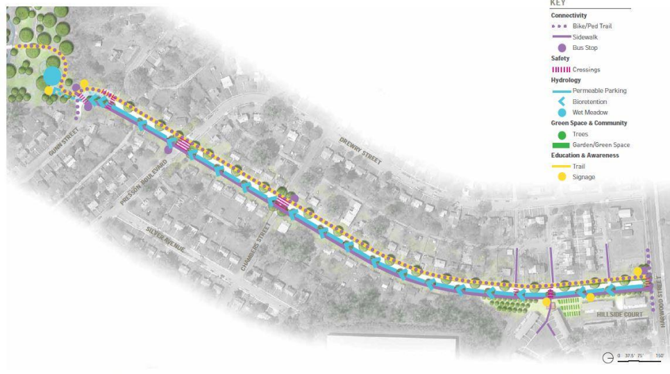
MINEFEE STREET CONCEPT DIAGRAM