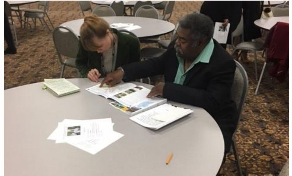
Environmental Justice Meeting held by Congressman McEachin