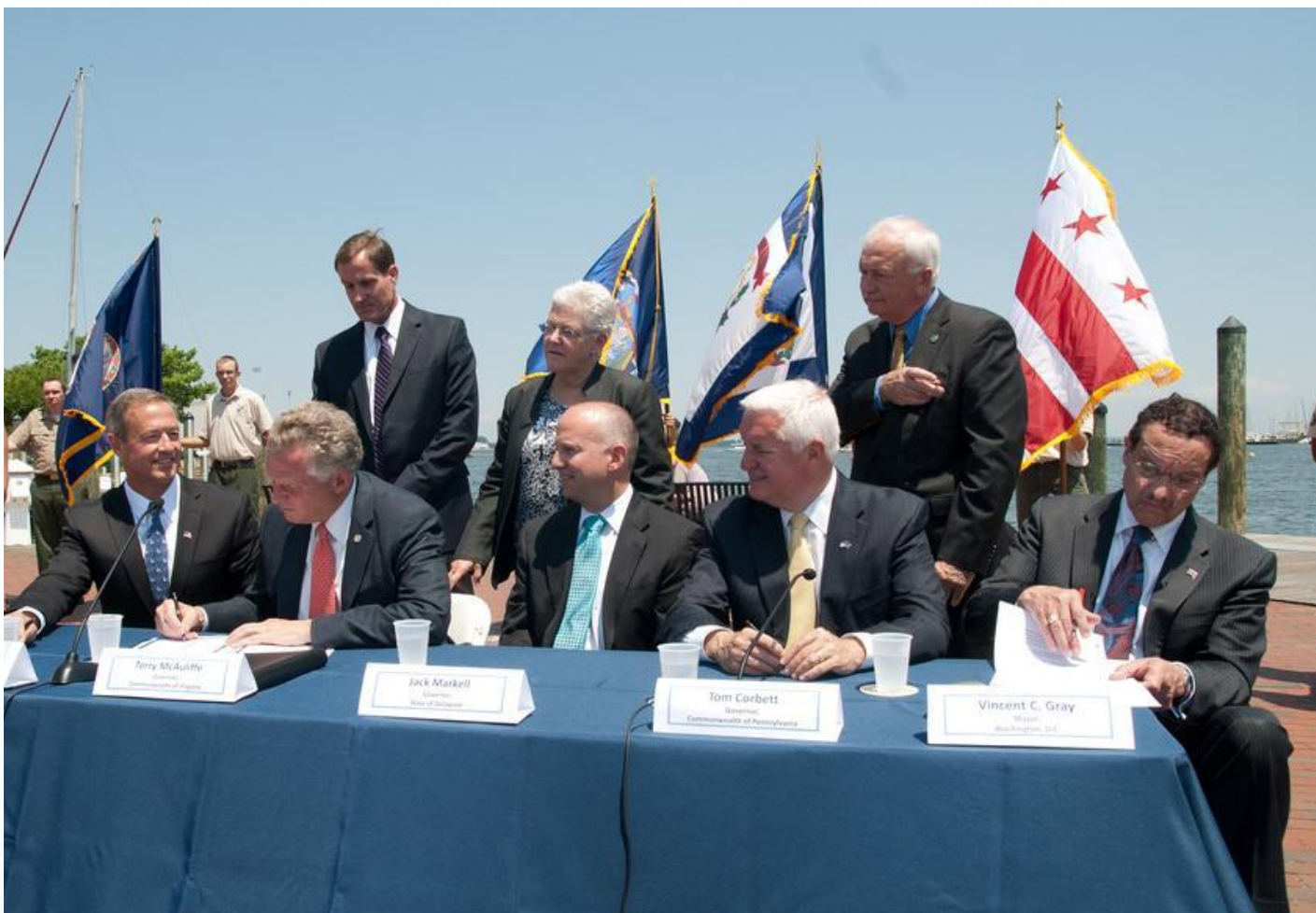
Perry McAuliffe Governor Commonwealth of Virginia